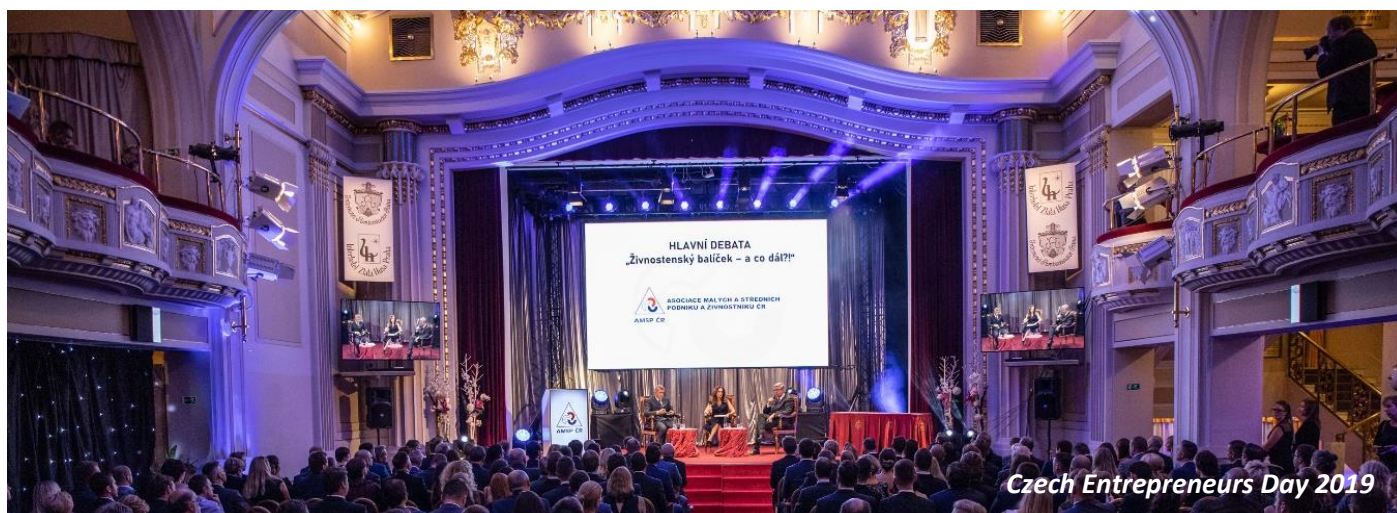
Czech Entrepreneurs Day 2019

The Association publishes the Trade News magazine, a number of business manuals and books, and professional newsletters. It also manages nine portals. It announces annual competitions for the best family business, start-ups and enterprising women, recognizes the best rural entrepreneurs and the most active craft guilds, and provides dozens of patronages. The Association purposefully collects all data on the SME segment, publishes its own analyses, manages statistics and conducts research. Thus, it has the most extensive database mapping the small business segment, which is used both by its members and by public institutions, schools or the media. Every year, it announces a programme focusing on an important business area (Year of Crafts 2016, Year of Rural Business 2017, Year of Family Business 2018, Year of Digital Business 2019, Year of Small Business 2020). The Association is a member of most government or departmental committees. In April 2015, the Association was among the first 17 Czech signatories of the UN Global Compact (the largest CSR network sponsored by the UN).